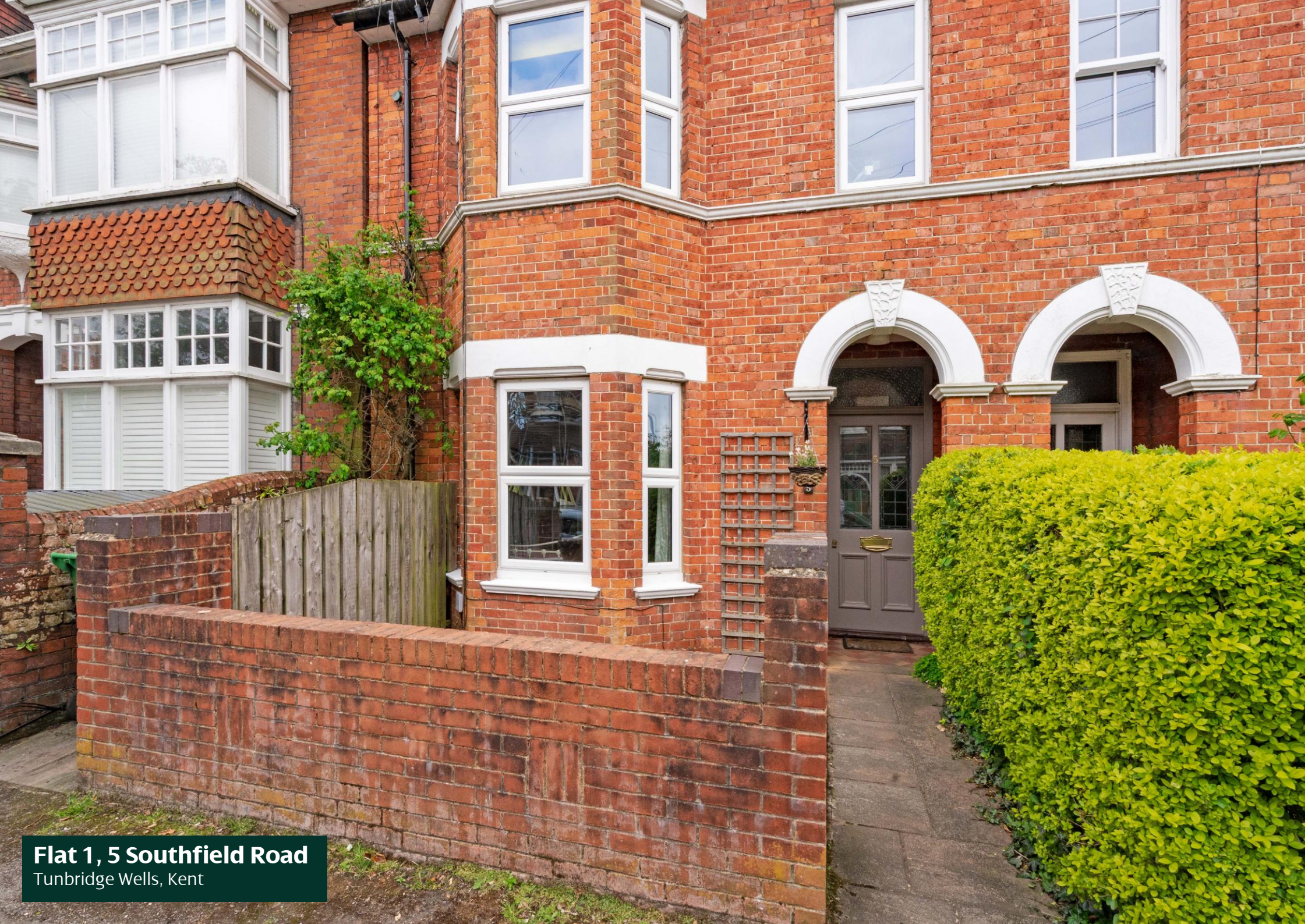
Flat 1, 5 Southfield Road Tunbridge Wells, Kent