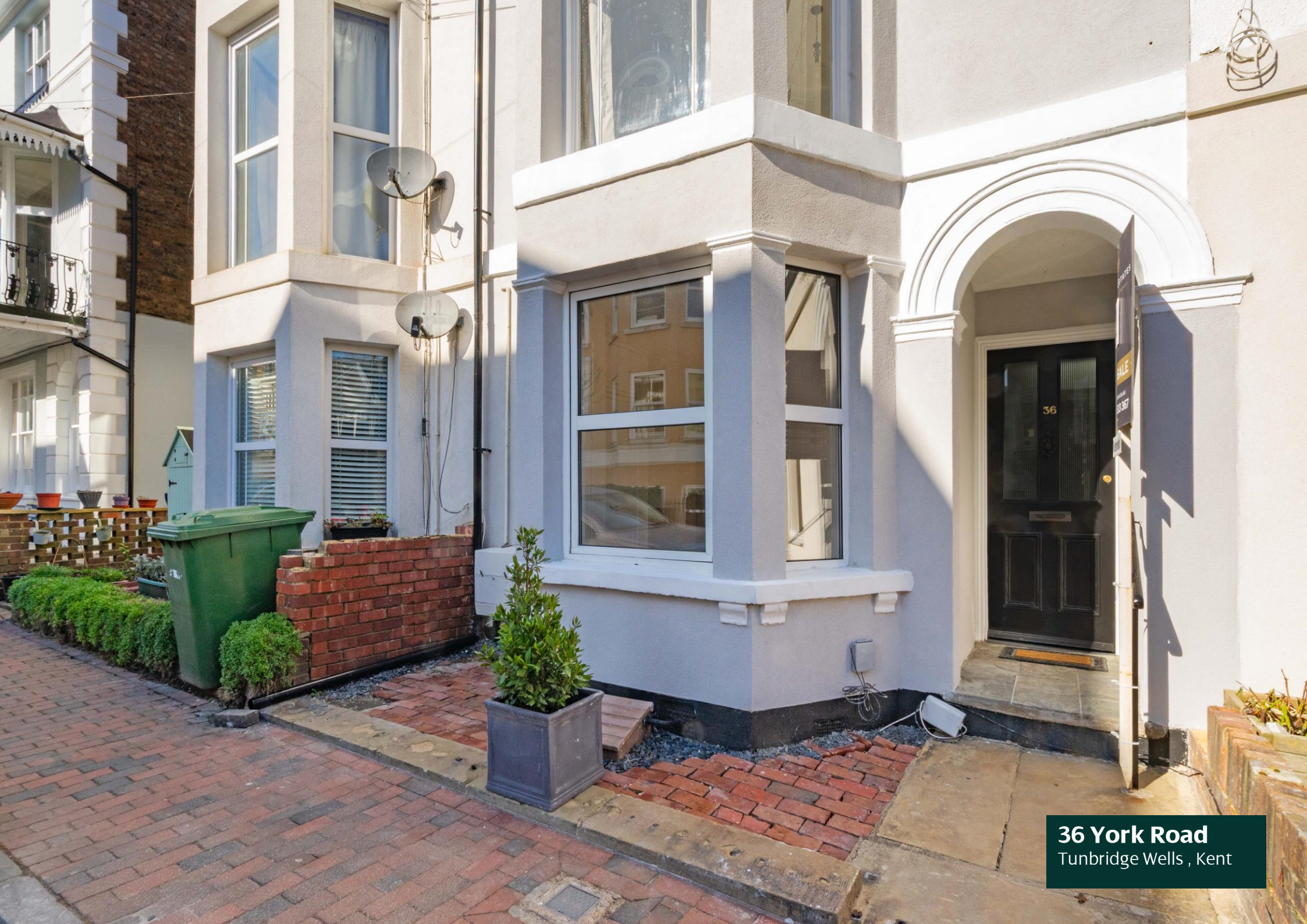
36 York Road Tunbridge Wells , Kent