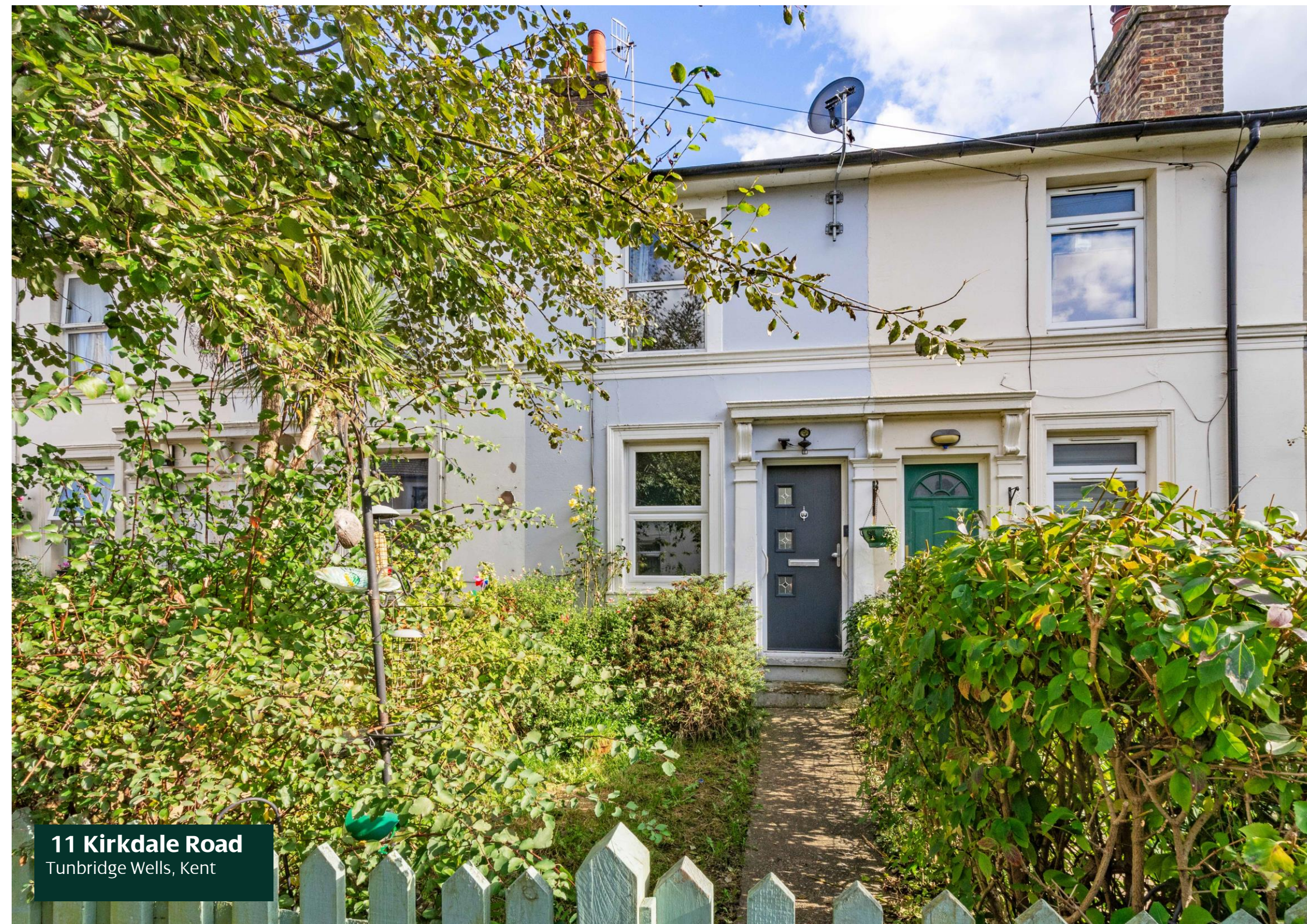
11 Kirkdale Road Tunbridge Wells, Kent