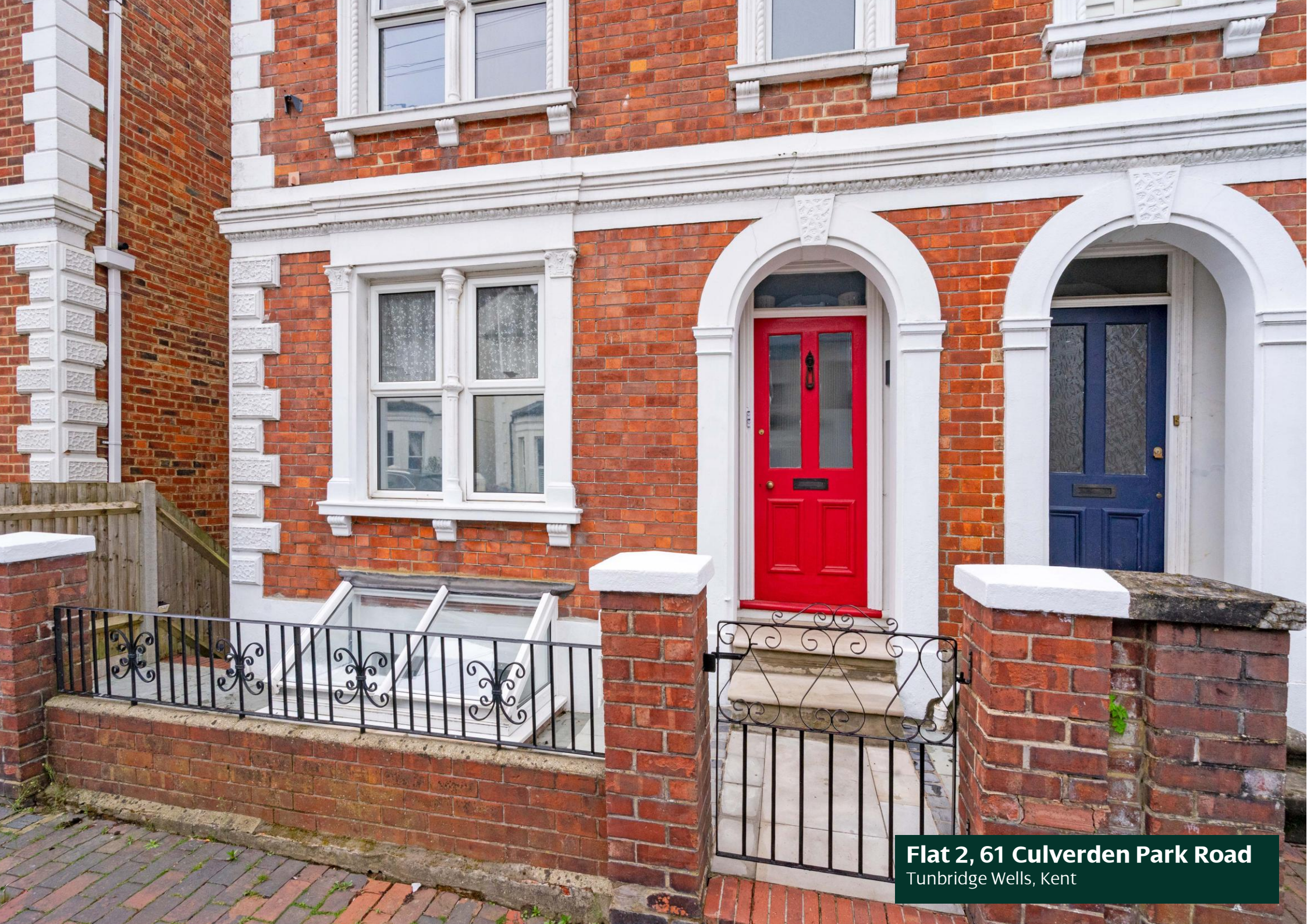
Flat 2, 61 Culverden Park Road Tunbridge Wells, Kent