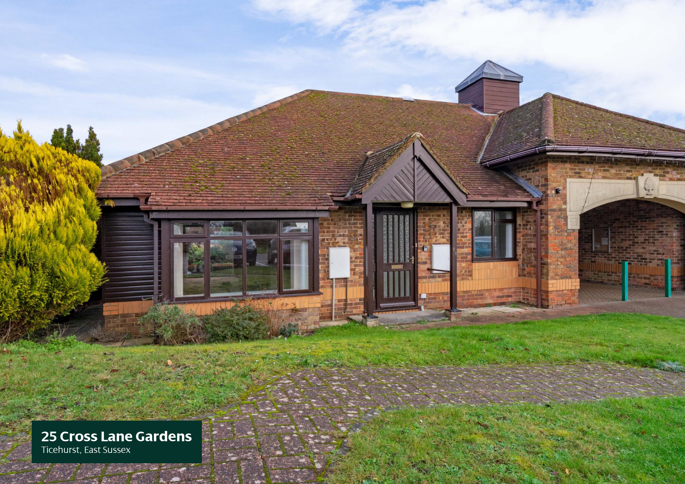
25 Cross Lane Gardens Ticehurst, East Sussex