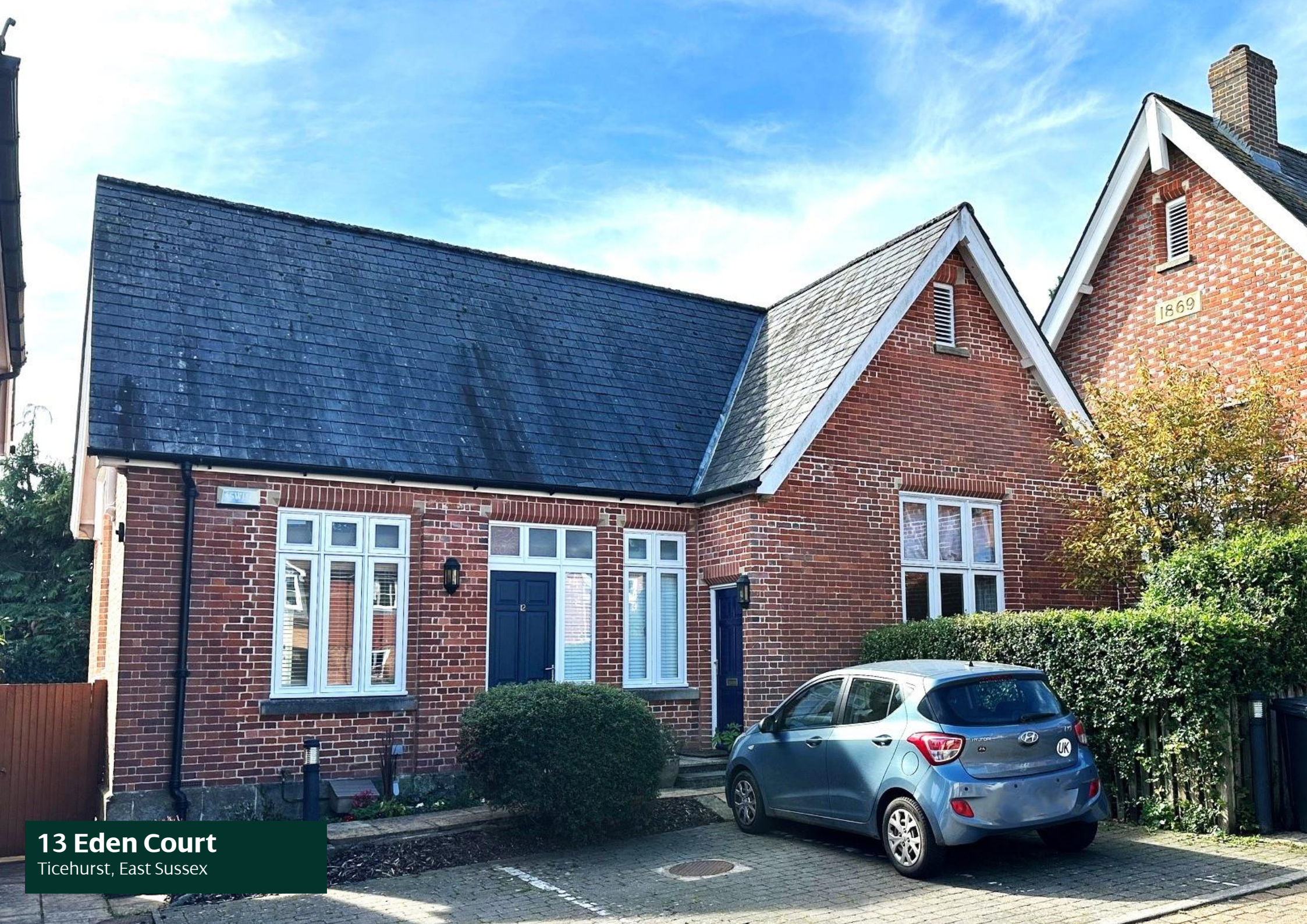
13 Eden Court Ticehurst, East Sussex