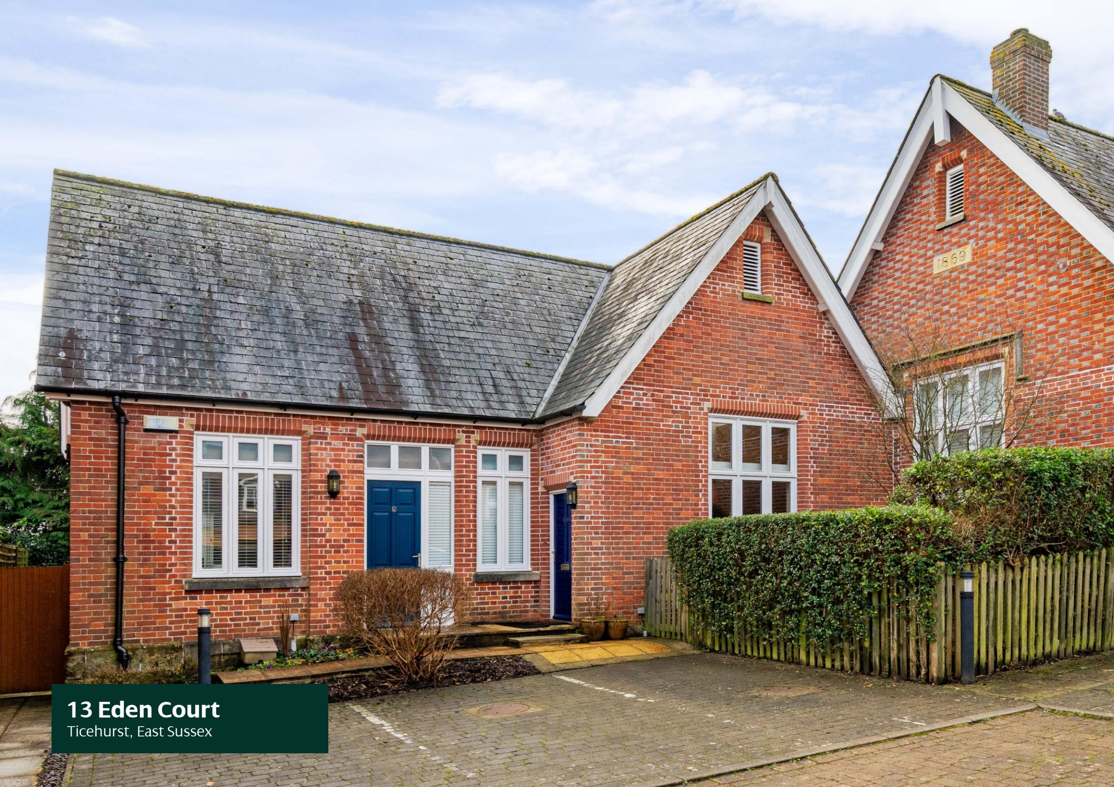
13 Eden Court Ticehurst, East Sussex