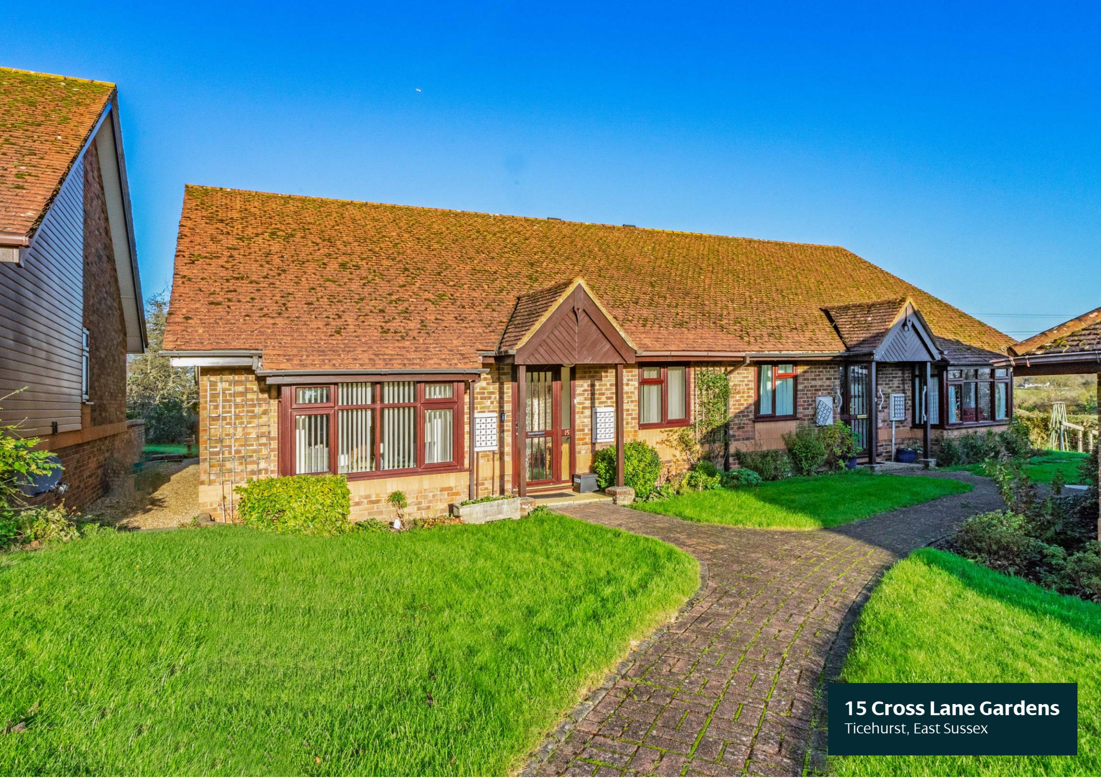
15 Cross Lane Gardens Ticehurst, East Sussex