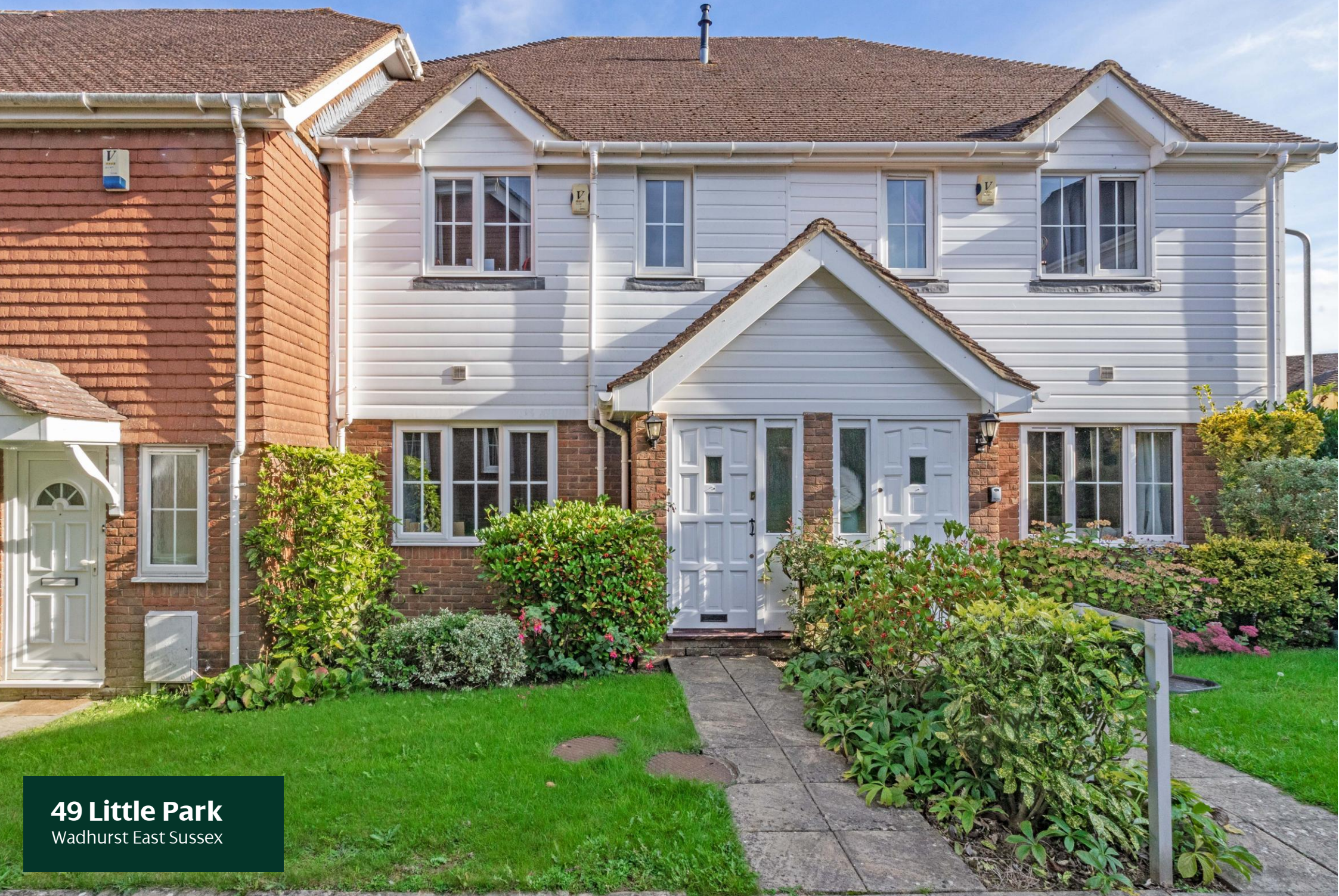
49 Little Park Wadhurst East Sussex